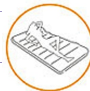
Air cushion bed