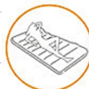
Air cushion bed